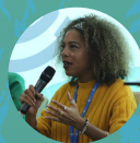
Full Exclusivity of Speaking Topics