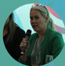
Sector Leading Keynotes