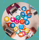
All-Inclusive Marketing Content