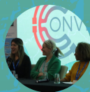
Interactive Panel Debates